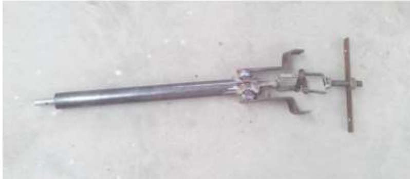
Fig.-2. Steering Pre-Assembled

Some current models of one-hand propelled manual wheelchairs have steering mechanisms which control the position of the front casters. This makes it very difficult or impossible for the chair to be steered by anyone other than the user, i.e. an attendant cannot have complete control of the chair. In order for the chair to be marketable to the largest possible population, this problem must be eliminated.