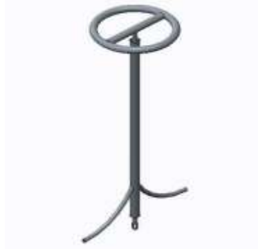
Fig.3. Vehicle Mechanic