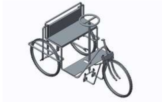
Fig.1- Mode Of Manual Wheelchair Propulsion

propulsion mechanisms has been used and non-conventional techniques have been proposed to reduce the impact of the conventional wheelchair propulsion technique on the quality of life of handicapped persons.