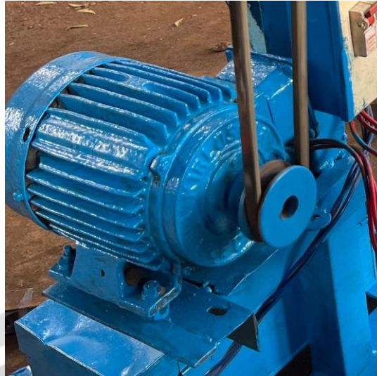
Fig – 3 3 phase motor