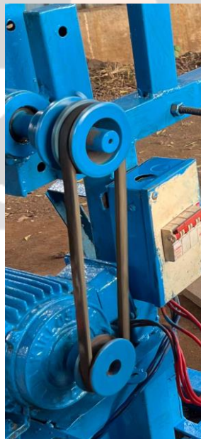
Fig – 4 Belt-Driven Transmission