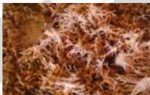
Photo 1: Paddy seed germ