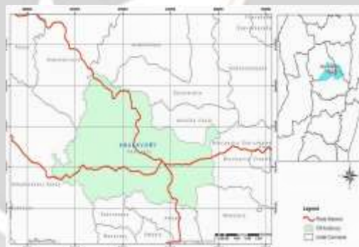
Fig-1: Location map of the rural commune of Analavory, Madagascar

According to the data of Ampandrianomby, the rural commune of Analavory is located on the latitude: 18°58'42.01"S and the longitude: 46°42'45.35"E