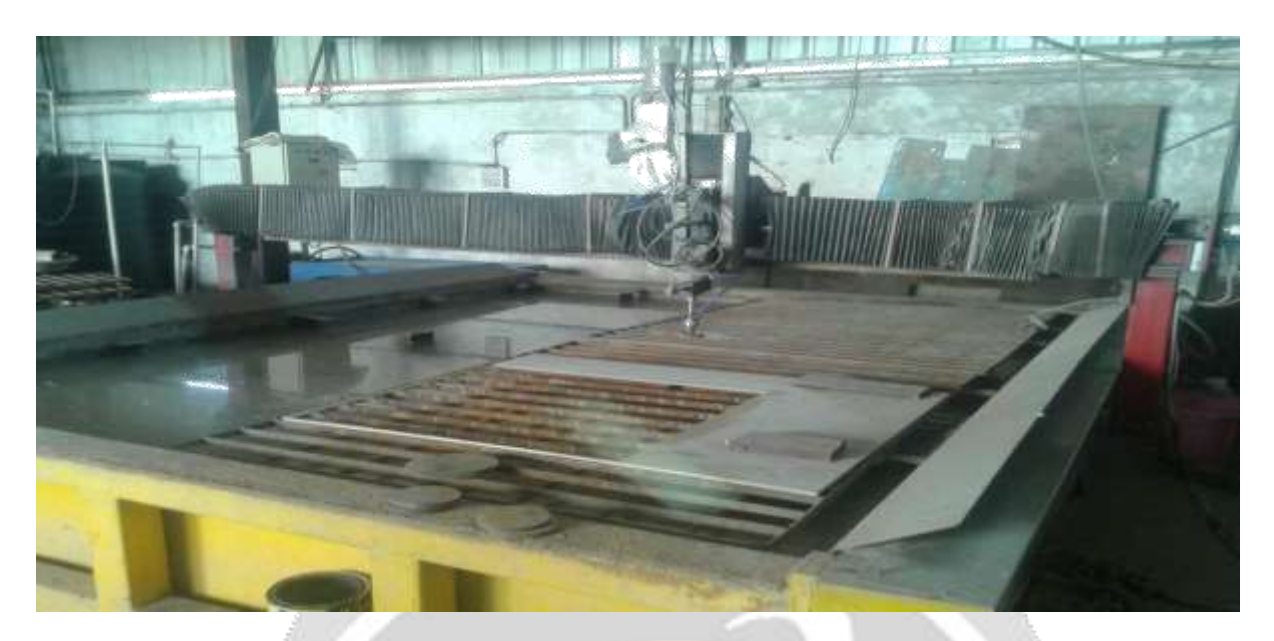
Fig. 5.1 Abrasive Water Jet Machine

Material will use as work piece: AISI 308 as a work piece material. Stainless steel 308 is oxidation resistant, corrosion resistant and high strength material.