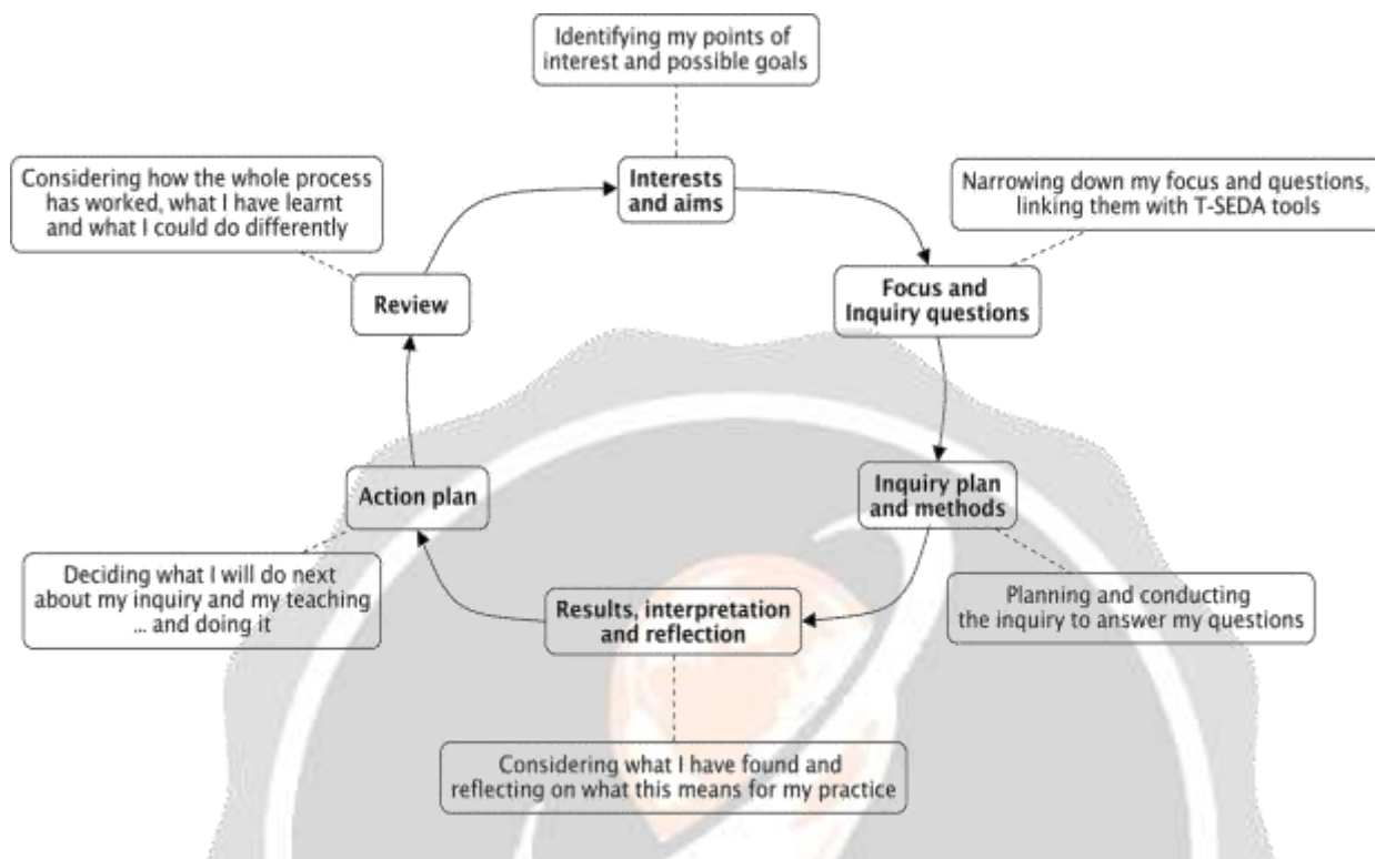
Figure 2. Reflective Inquiry Cycle

A completed reflective cycle can be an effective way of sharing investigation findings with colleagues. (Ahmed and Kershner 2019)