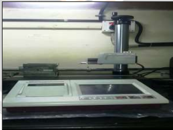
Fig -3: Surface grinding machine