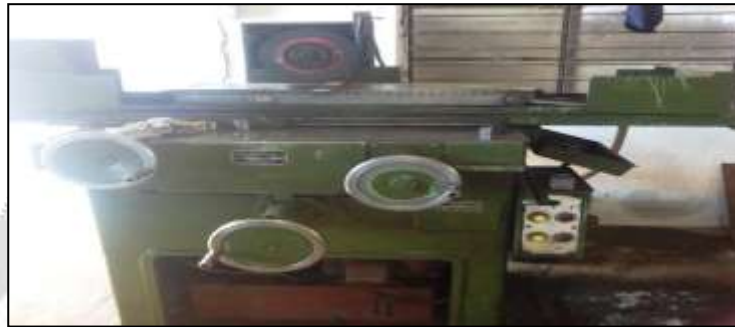
Fig -2: Surface grinding machine