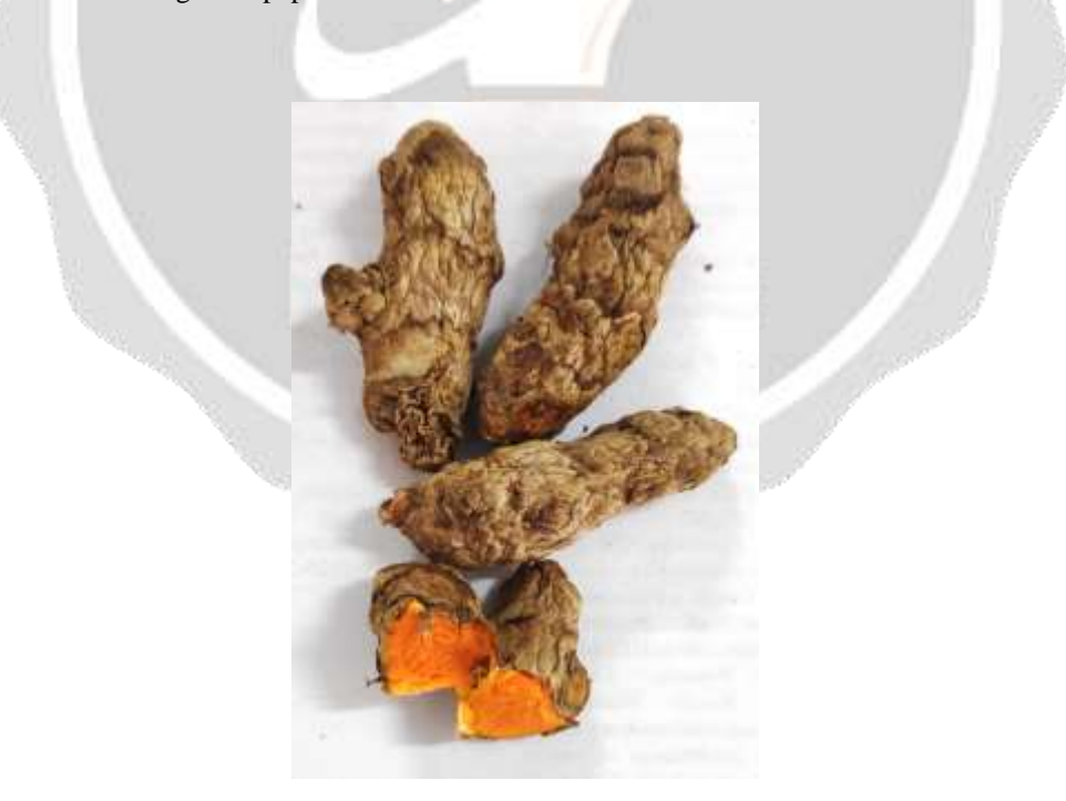
(Figure – 1: Curcuma longa)

The extraction was made in 100% alcohol. Here ethanol and methanol was used for extraction. About 5gram of sample was weighed and added to the conical flasks to which ethanol and methanol was added. In case of fresh Curcuma longa , they were descaled, cut into small pieces, grinded in mortar and pestle and about 5gram of the ground paste was taken for extraction. The conical flasks were then kept in an orbital shaker at 120rpm for 24hrs. The content was filtered using filter paper and was stored at 4^{\circ} C until use.