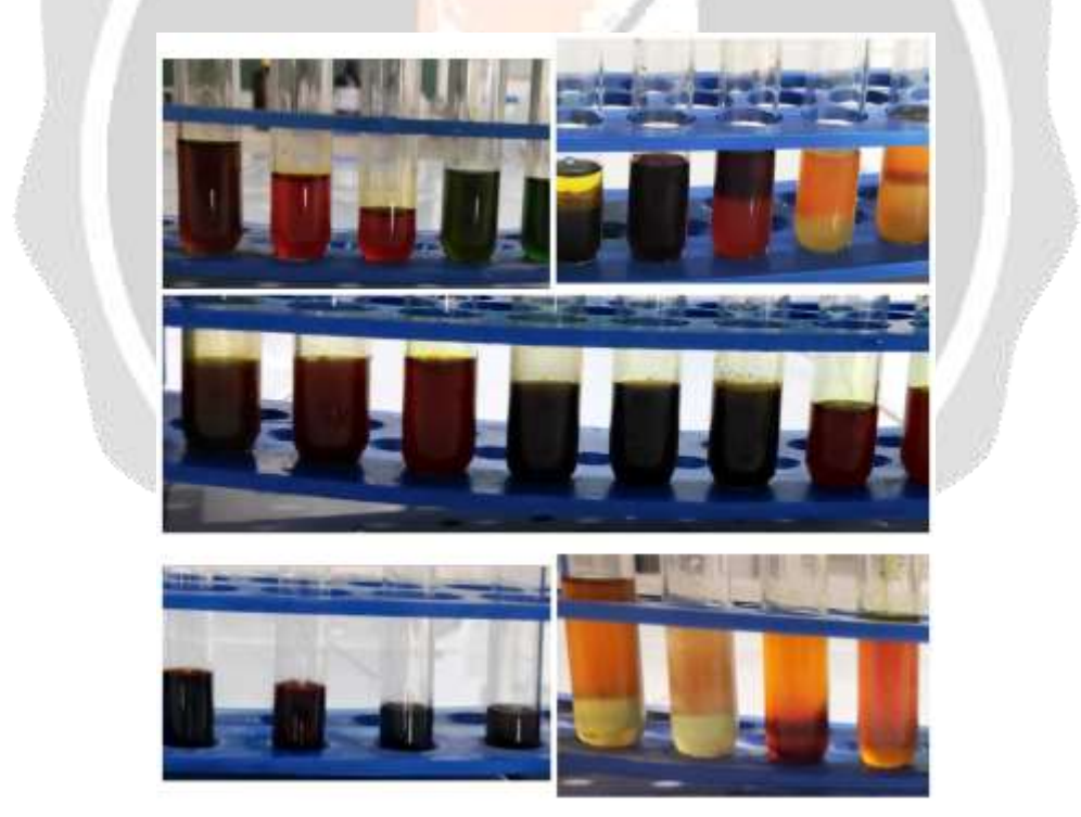
Figure-7: Test for coumarins and terpenoids, Mayer's test, Borntrager's test, Wagner's test