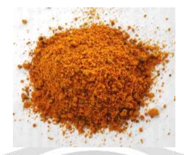
(Figure – 2: Curcuma longa, shade dried and powdered)