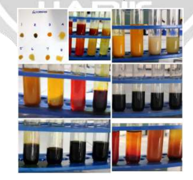
Figure -5: Tests for glycosides, killer Killani, phenol (gelatin test),

The test for secondary metabolites are done they include the tests for alkaloids, glycosides, Glycosides, Cardiac Glycosides, Phenol, Tannins, Flavonoids, Phytosterols, Phlobatannins, Saponins, Steroids, Xanthoproteins, Terpenoids, Coumarins and Quinone. In the Dry extracts of Curcuma longa the alkaloids, glycosides, phenol, flavonoids, Phlobatannins, Steroids, Xanthoproteins, Coumarins and quinones were present and tannins, saponins, terpenoids were absent. Whereas in the fresh extract, Alkaloids Glycosides, Cardiac Glycosides, Phenol, Flavonoids, Phytosterols, Steroids, Xanthoproteins, Coumarins and quinones were present and Tannins, Phlobatannins, Saponins, Terpenoids were absent. The results are shown in the figure 5, 6, 7.