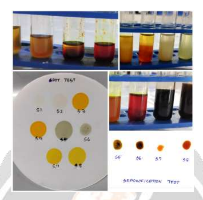
Figure-4: Qualitative analysis of miscellaneous compounds