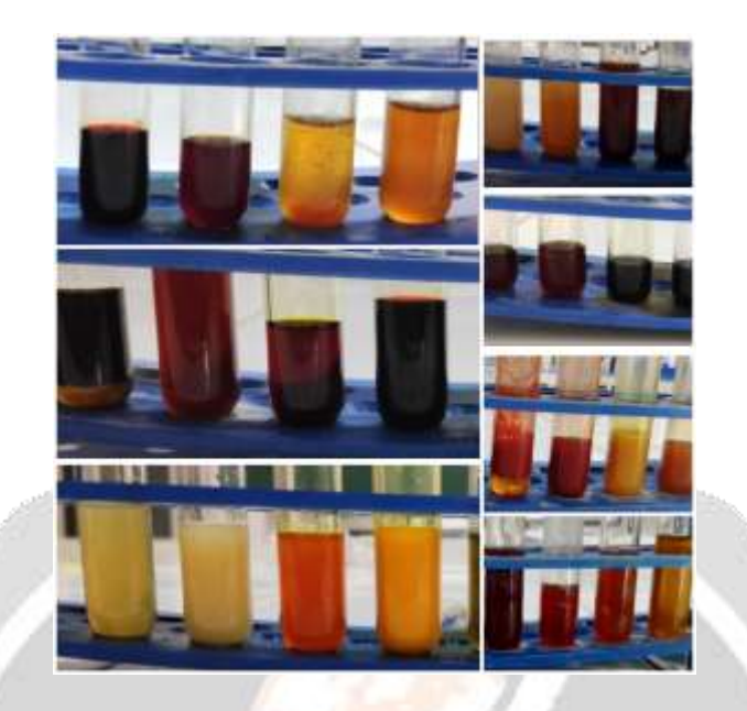
Phenol (lead acetate test), phytosterols, quinones and tannins