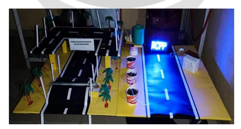
Fig. 3: Working model

LDR Stands for Light Dependent Resistance. It is also known as a photoresistor which is a passive electronic component whose resistance varies with the intensity of incident light. During the day time as light increases resistance decreases and during night time as light decreases the resistance increases vice versa. The primary function of an LDR is to detect changes in light intensity. As the amount of light falling on the LDR changes, its resistance changes accordingly [7].