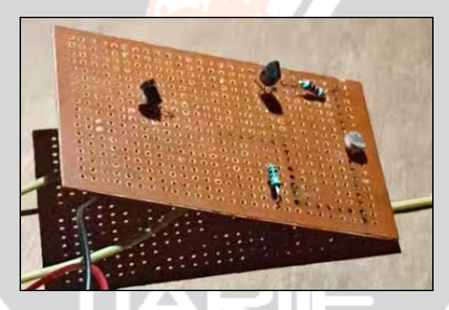
Fig 1. Dark Sensing Circuit

Dark sensing circuit senses the dark and switches the light on. The LDR used in these circuit stop the flow of current in the circuit as light rays fall on it during the day time. And During night time as the circuit sense the dark circuit gets completed and street lights on the road side gets automatically switch ON. A dark sensing and switching circuit also known as a light dependent resistor (LDR) circuit, is designed to detect changes in ambient light levels and a switch or relay accordingly. Its resistance changes based on the intensity of light falling on it. In darkness, its resistance is high, and in light, its resistance decreases [4]. In darkness, the resistance of the LDR is high, causing the voltage at the junction between the LDR and the resistor to be relatively high. This process is fully automatic due to the sensor used in the circuit. We have also used the dark sensing circuit in the digital display, automatic drip irrigation system. The displays on roadsides or highway can be used to show distance between two mega cities or upcoming villages or city names. Fig. 1 shows the dark sensing & switching circuit.