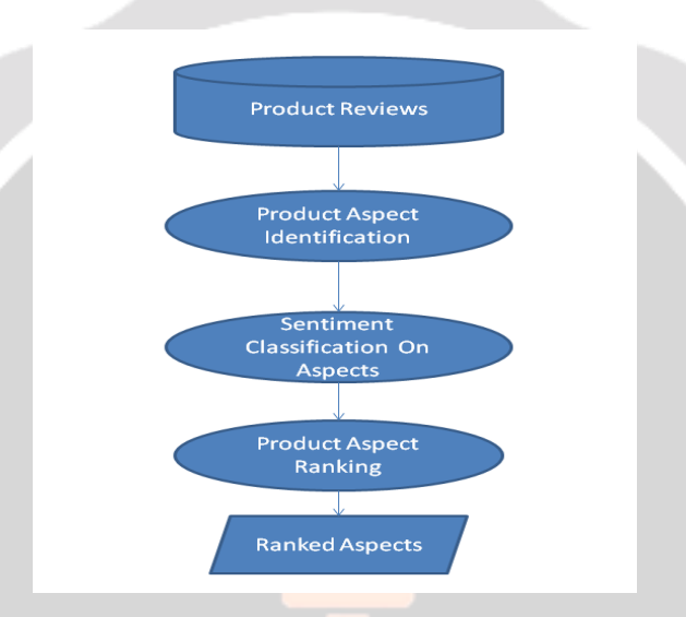
Fig-2[1]: Product Aspect Ranking Framework System workflow.

When consumer reviews are given, we, first of all, recognize the aspects in the opinions and then examine consumer reviews on the aspects by making use of the sentiment classifier.