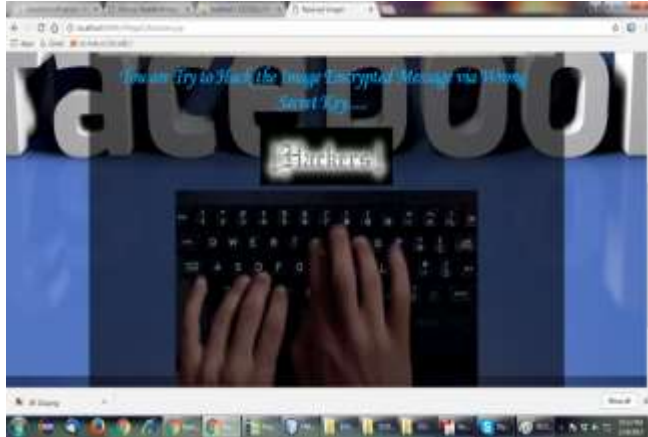
Fig 2. Depicts hackers trying to hack the data by entering the wrong secret key.