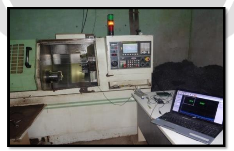
Fig -1: Experiment Set up

The experimental setup for this project is as shown in figure. It includes a CNC lathe of turning with MIDAS-0 turning center tool holder, work piece without any cutting fluid. The tool is instrumented with two accelerometer (of Brule and Kjaer type 4517). The accelerometer signals has taken to data aquistation card system using lab view software. The vibration data is captured by DAC system. This include hardware section, circuit design & implementation hardware interface, circuit turbo shooting, filtering, computer software programming. For experiment purpose work piece of SS304 is used. Shape of work piece is solid round bar. Dimension of solid round bar is of Diameter of 30 mm and length is 30mm