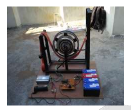
Fig:4. Experiment setup