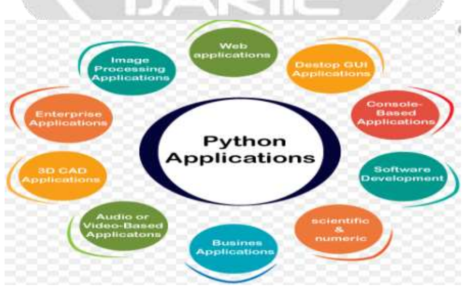
Fig-2 Python application types diagram