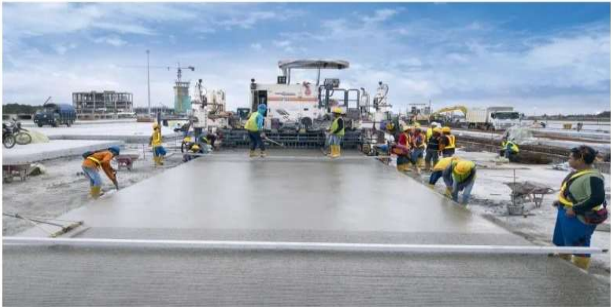
Fig:- Air Port Construction & Taxiway Construction