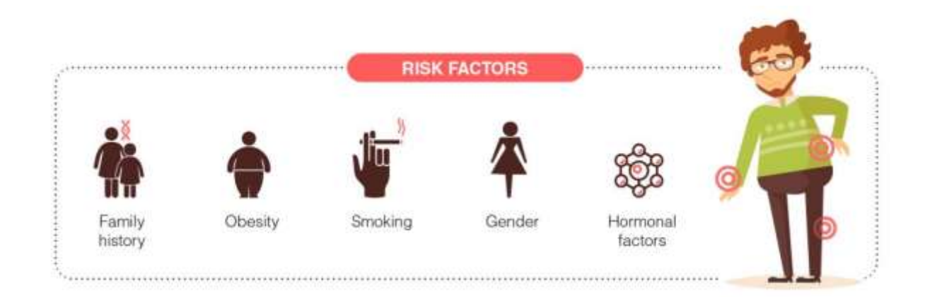
Fig 2: Risk factors

Age:RA can begin at any age, but the likelihood increases with age. The onset of RA is highest among adults in their sixties.