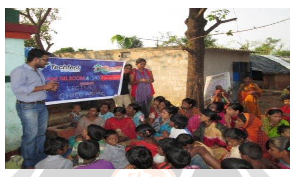
Figure No.-3: Lecture on Child Abuse