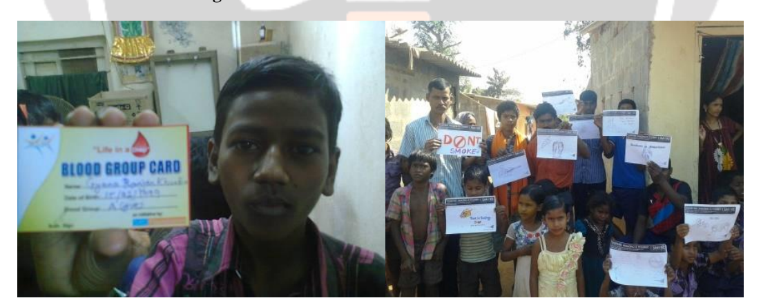
Figure No.-4: Different Activities for Health Awareness

This NGO also works on health related issues such as awareness for pulse polio and other dangerous diseases spreading in slum areas. They also tell them the procedure to get cure from many breathtaking diseases and organize various health related programmes based on the diseases spreading the most. They also take the responsibility to aware the slum area people about the HIV AIDS as they are in the most dangerous edge of this disease. Along with this they do Blood group test of those children whose blood group is unknown and provide blood group card to them for future correspondence.