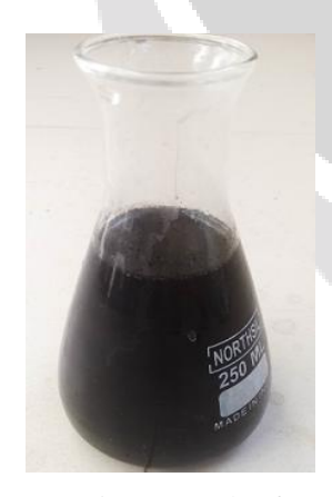
Fig -3 Sample of Aqueous solution

Take 1500ml of aqueous solution into round bottom flask and then start heating. Cold water is used for circulation in condenser for condensation. Also put the thermometer on the round bottom flask for the measurement of temperature and Set the temperature of heater as 80^{\circ} C. The vapour will condense and we collect it as distilled. The temperature is around 170\text{-}180^{\circ} C , In this temp 70% water will be vaporized and it will collect in to the flask is called cut-1. The temperature was allowed to increase from 180\text{-}195^{\circ} C , In this temp 12% water and 4-aminophenol mixture will be vaporized and it will collect in to the flask is called cut-2 .Some part remains in the flask as residue. From the 1500ml feed we get, cut-1 1070 ml, cut-2 170 ml, Residue- 285 ml.