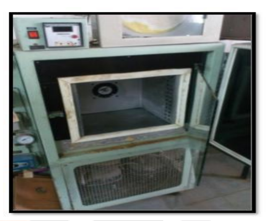
Figure 1: Cascaded refrigeration apparatus