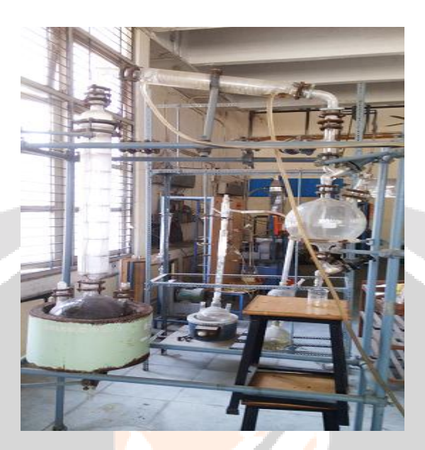
Fig 2. distillation column apparatus