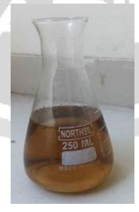
Fig - 4 Sample of cut-1