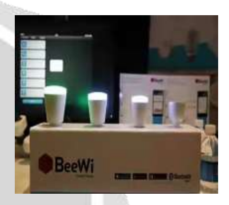
Fig4: Light Sensor