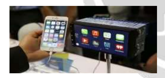
Fig5: in-vehicle infotainment system