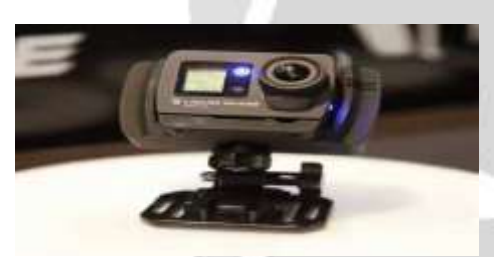
Fig13: Wearable Camera