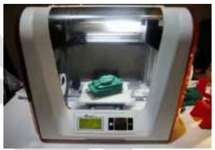
Fig12: 3D Printer