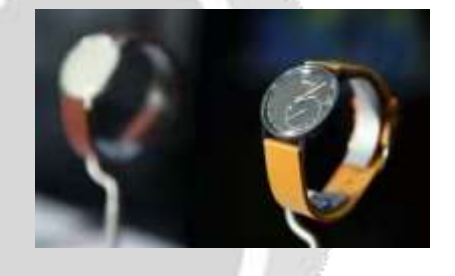
Fig14: Smart watch