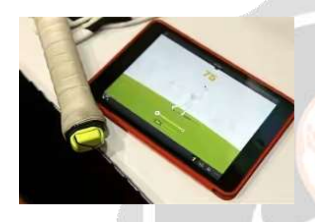
Fig3: Swing sensor