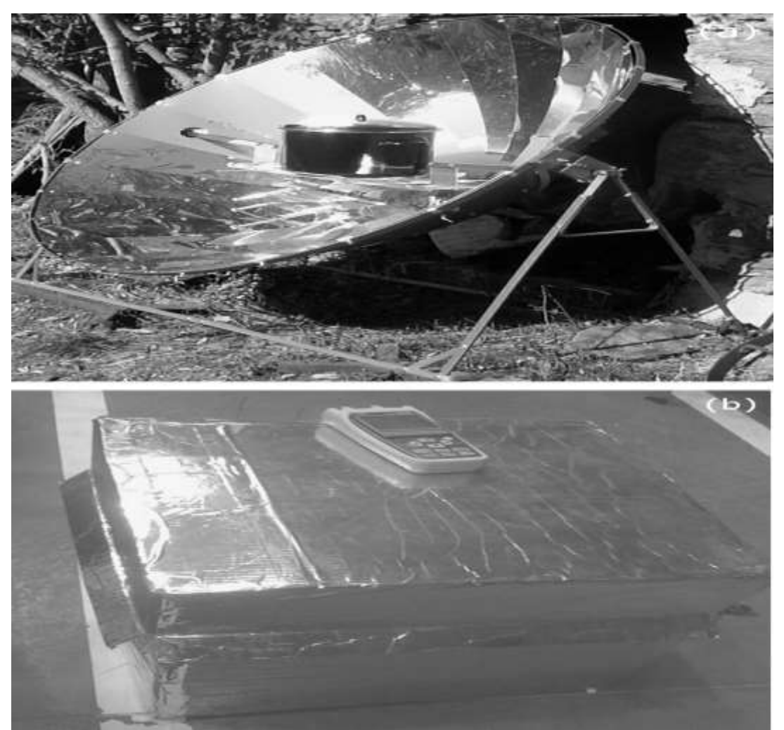
Fig-1 Cooker B in operation showing the focused sun on the utensil. (b) Insulating box closed and instrumentation.