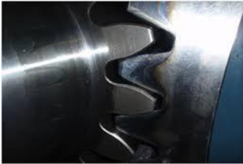
Fig.4. Gear Problem Area

The objectives in the modeling of gears in the past by other researchers have varied from vibration analysis and noise control, to transmission error during the last five decades. The goals in gear modeling may be summarized as follows: