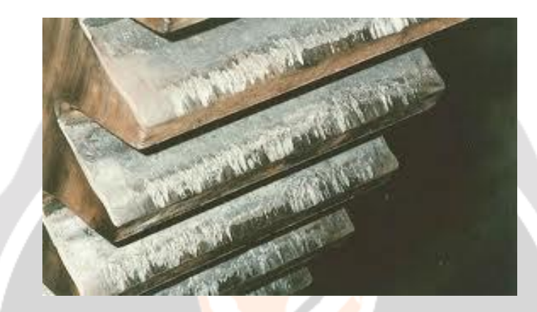
Fig.1. Gear scuffing Effect

While other modes of lubrication related tooth failures such as contact fatigue (pitting and micro-pitting) and wear generally take a long period of operation to reach the state of catastrophic failure, scuffing occurs early in the life span of a gear pair.