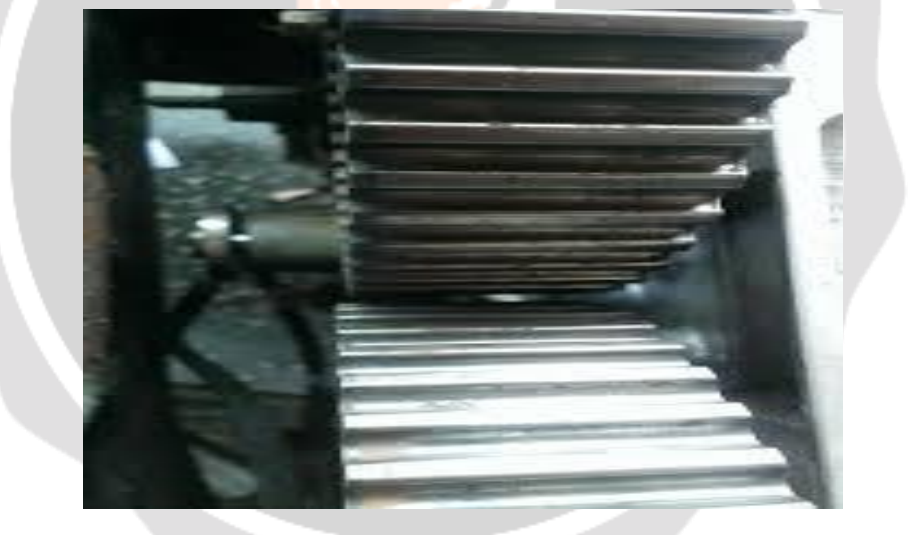
Fig.3.Gear Arrangement for Analysis and Design

Current design is giving the problem of Gear stucking and scuffing for Strip Roller Machine of Wheel Rim Manufacturing unit. In spite of the number of investigations devoted to gear research and analysis there still remains to be developed, a general numerical approach capable of predicting the effects of variations in gear geometry, Hertz contact stresses, bending stresses and Von Mises stresses. The objectives of this thesis are to use a numerical approach to develop theoretical models of the behavior of spur gears in mesh, to help to predict the effect of gear tooth stresses and transmission error. The main focus of the current research as developed here is: