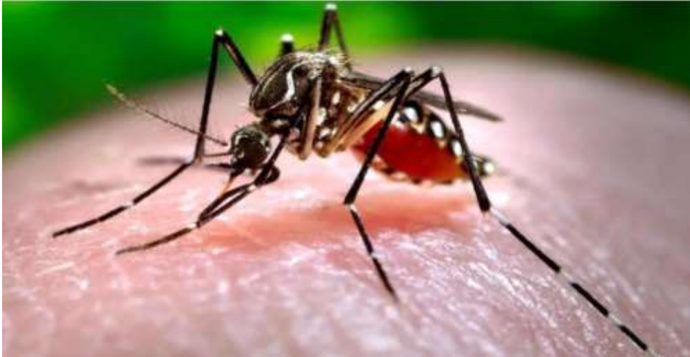
Figure-1: The Aedes aegypti mosquito biting human flesh.