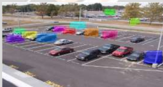
Figure 1: Parking Space detection using Mask R-CNN

In this method, we are proposing to use a system which does not have much requirement in the hardware section. Our method should work effortlessly with softwares only without relying much on the hardware components. Our secondary aim is to inform the user of a free parking space. In the first stage, the video footage from the camera is fed into the neural network. The network then detects for the valid parking spaces by analysing various conditions. Upon detecting a valid parking the algorithm detects if a parking space is free or not. If it is free then the user is notified by a message on their phone and if not then the algorithm keeps on checking for a free space.