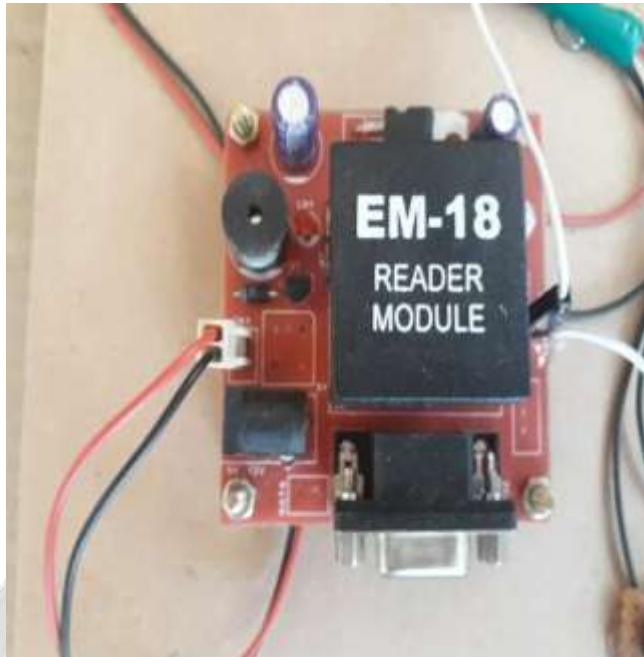
Fig-4: RFID Reader

RFID is a following innovation used to recognize and validate labels that are connected to any item, individual or creature. Radio recurrence Identification and Detection is a general term utilized for advances that influence utilization of radio waves keeping in mind the end goal to recognize questions and individuals.