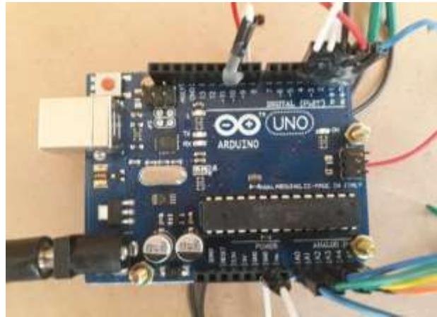
Fig-2: Arduino board

The Programming of the Arduino is either in C/C++. On the off chance that you're acquainted with C, programming of the Arduino is immediate to see. If you are not familiar with C no try grabbing data of is to be had in the case codes. The Arduino Board is alluded to as ISP changes into when the code dumped inside the Board can be use at each time, wherever.