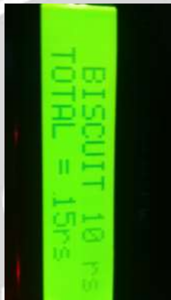
Fig-5 Displaying Price List of the Product