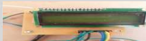
Fig-3: Liquid Crystal Display

LCD (Liquid Crystal Display) screen is an electronic show module and locate an extensive variety of utilizations. A 16x2 LCD show is extremely fundamental module and is usually utilized as a part of different gadgets and circuits.