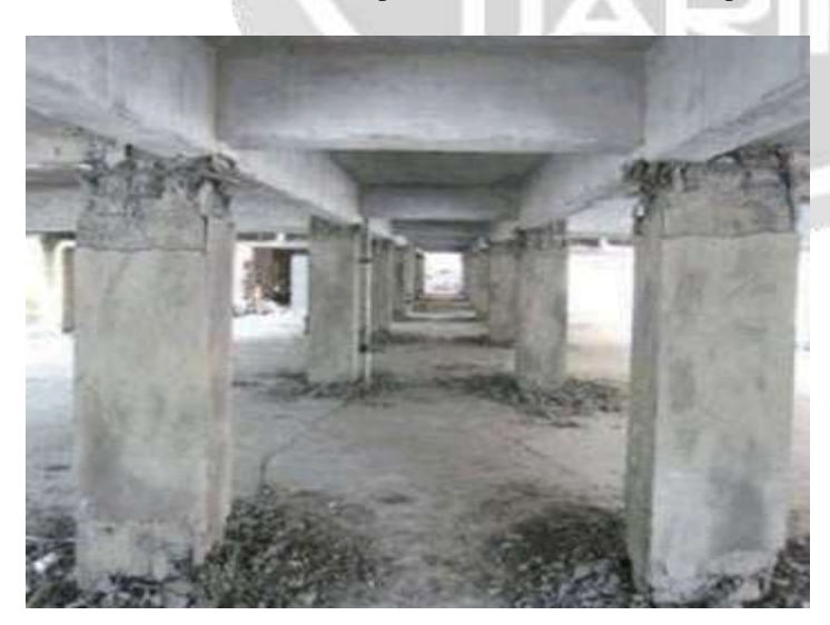
Fig. 1: Columns in the bottom open story of a six-story building, after undergoing plastic hinge due to the earthquake

A typical example of the identical is an open story building, where the underside floor is built open for considering the parking utilities and other people spaces, as shown in figure.1. This floor hence incorporates a lower structural stiffness compared to the above floor. It represents a vertical symmetry