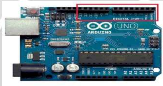
Fig -1: Arduino UNO

It is a microcontroller board developed by Arduino.cc and based on Atmega328. Arduino is an open-source prototyping platform in electronics based on easy-to-use hardware and software. Subtly speaking, Arduino is a microcontroller based prototyping board which can be used in developing digital devices that can read inputs like finger on a button, touch on a screen, light on a sensor etc. and turning it in to output like switching on an LED, rotating a motor, playing songs through a speaker etc. UNO is based on ATmega328P microcontroller. There are two variants of the Arduino UNO: one which consists of through – hole microcontroller connection and other with surface mount type. Through-hole model will be beneficial as we can take the chip out in case of any problem and swap in with a new one. Arduino UNO comes with different features and capabilities. As mentioned earlier, the microcontroller used in UNO is ATmega328P, which is an 8-bit microcontroller based on the AVR architecture.