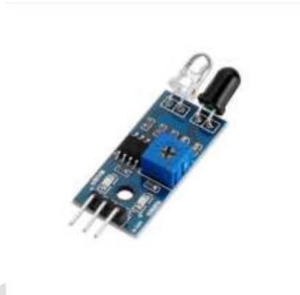
Fig-3: IR Sensor

While measuring the temperature of each colour of light (separated by a prism), he noticed that the temperature just beyond the red light was highest. IR is invisible to the human eye, as its wavelength is longer than that of visible light (though it is still on the same electromagnetic spectrum).