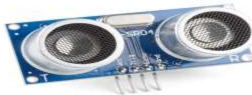
Fig-2: Ultrasonic Sensor

Typically, a microcontroller is used for communication with an ultrasonic sensor. To begin measuring the distance, the microcontroller sends a trigger signal to the ultrasonic sensor. The duty cycle of this trigger signal is 10\mu\text{s} for the HC-SR04 ultrasonic sensor. When triggered, the ultrasonic sensor generates eight acoustic (ultrasonic) wave bursts and initiates a time counter. As soon as the reflected (echo) signal is received, the timer stops. The output of the ultrasonic sensor is a high pulse with the same duration as the time difference between transmitted ultrasonic bursts and the received echo signal.