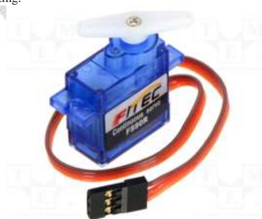
Fig-4: Servo Motor

The very simplest servomotors use position-only sensing via a potentiometer and bang-bang control of their motor; the motor always rotates at full speed (or is stopped). This type of servomotor is not widely used in industrial motion control, but it forms the basis of the simple and cheap servos used for radio-controlled models. More sophisticated servomotors use optical rotary encoders to measure the speed of the output shaft and a variable-speed drive to control the motor speed. Both of these enhancements, usually in combination with a PID control algorithm, allow the servomotor to be brought to its commanded position more quickly and more precisely, with less overshooting.