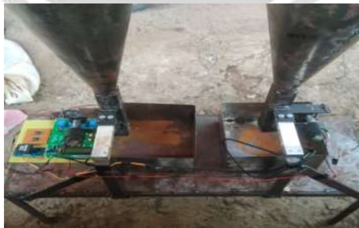
Fig-3: Fabricated setup

The PIN 19-22 of the microcontroller is connected to each relay. Four relays are powered by battery. The RV1 and RV2 is the analog channel of the load cell. Thus each analog signal is given to PIN 2 and PIN 3 of the microcontroller. When a personnel need an amount of item that set with help of keypad and the LCD screen. The item released by the container 1 through a valve controlled by a motor. When the analog signal balances the digital value set according to the coding the valve closes. Then the container 2 opens the valve and does same as container 1. The relay 1 and 2 is used for controlling the opening and closing of the valve of container 1. The relay 3 and 4 is used for controlling the opening and closing of the valve of container 2.