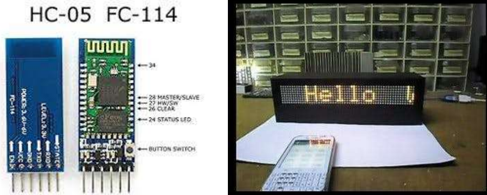
Fig-2: Bluetooth module

This system is actually divided in main two parts, one is message transmission section which is android phone and another is reception and displaying section. The Android phone is service which is used to transmit the text message which is to be displayed on LED board. At the input/transmitter side the android phone is used to generate input to the system. The software used is arduino development tool. In that tool APK application is used for sending texts or numbers using Bluetooth access. The message sent by Bluetooth is in the form of ASCII codes. At the receiver side Bluetooth receiver is used. It receives ASCII codes from transmitter and gives to arduino development board which is controlled by AVR controller. The board is connected to 3 sets 16 rows x 32 columns LED display through SPI interface. The LED board displays this message using scrolling technique. So required information displayed on that board.