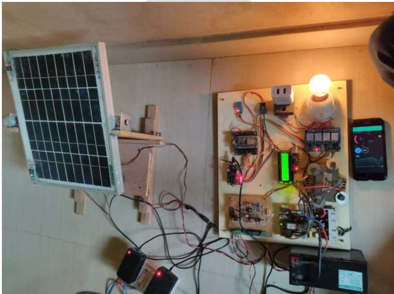
Fig.No. 2: Snapshot of Hardware Prototype

Since the system requires external power supply of 5 volts and 3.3 volts for its operation which can be taken rid of by utilising the power generated by solar panel only. Also with the help of motor and controlling it is possible to track the sun for better power generation. Apart from that by using various Machine Learning algorithms and model it is possible to make system smart enough to take decision about data and performance.