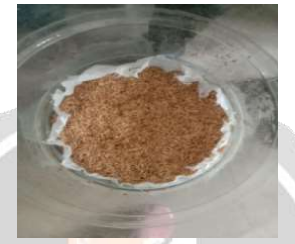
Fig 2.1: Rice husk

Rice husk preparation: Rice husk is taken for the preparation of sample and then it is washed severally with water and sun dried for a week ,after that the rice husk is placed at topmost layer in the experiment setup for the purification process before that the experiment setup is marked for the equal distribution of layers. The rice husk is placed according to the markup is done.