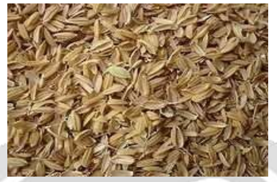
Fig 1.2.1: Rice husk

Rice husk. Rice hulls are the coatings of seeds, or grains, of rice. The husk protects the seed during the growing season and is formed from hard materials, including opaline silica and lignin. The hull is hard to eat or swallow and mostly indigestible to humans because of its enriched fiber components. However, during times of food scarcity in ancient China, a common daily meal was a pastry made from rice husks, wild vegetables, and soybean powder. This led to the idiom "meals of cereal ,hulls, and vegetables for half a year," indicating poverty and food