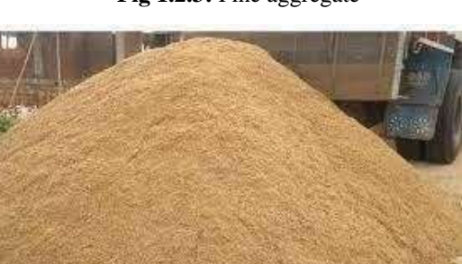
Fig 1.2.3: Fine aggregate

The sand used for the experimental programmed was locally procured and conformed to Indian Standard Specification IS:383-1970. The sand was first sieved through 4.75mm sieve to remove any particles greater than 4.75mm and then was washed to remove the dust.