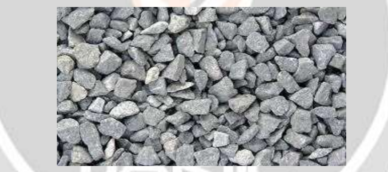
Fig 1.2.2: Coarse aggregate

The broken stone is generally used as a coarse aggregate. The nature of work decides the maximum size of the coarse aggregate. Locally available coarse aggregate having the maximum size of 20mm was used in our work. The aggregates were washed to remove dust and dirt and were dried to surface to dry condition. The aggregates were tested as per Indian Standard Specifications IS:383-1970.