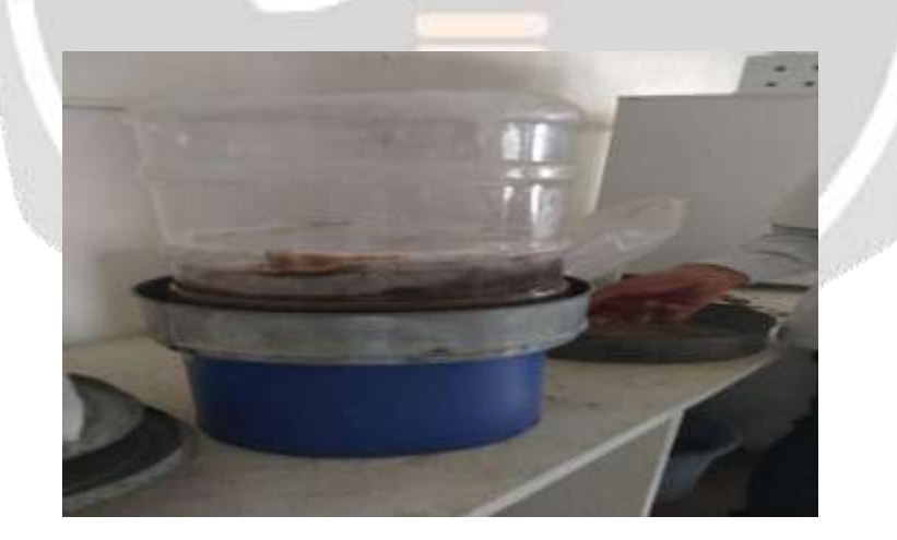
Fig 2.2: Coarse aggregate

Coarse aggregate preparation: Coarse aggregate is firstly collected of different sizes and then it should be sieved with the sieve sizes of 10mm,7.5mm,6mm,4.75mm and and it should be severally washed with water and it should be oven dried .After it is dried it should be placed in layer from descending sizes.