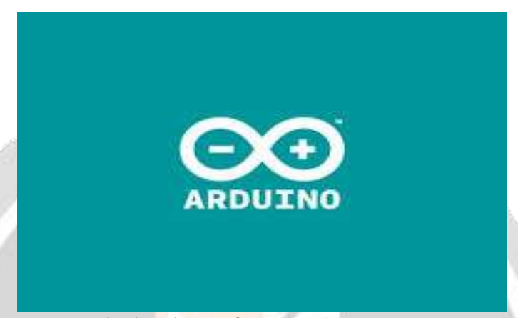
Fig. Arduino UNO

The open-source Arduino Software (IDE) makes it easy to write code and upload it to the board. This software can be used with any Arduino board. The new major release of the Arduino IDE is faster and even more powerful! In addition to a more modern editor and a more responsive interface it features autocompletion, code navigation, and even a live debugger.It connects to the Arduino and Genuino hardware to upload programs and communicate with them.