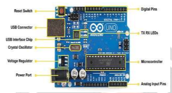
Fig. Arduino Kit

Arduino is an open-source electronics platform based on easy-to-use hardware and software. Arduino boards are able to read inputs - light on a sensor, a finger on a button, or a Twitter message - and turn it into an output - activating a motor, turning on an LED.