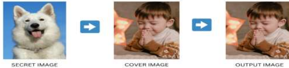
Fig-1: General working of steganography.

Techniques of information hiding have been available for a long time but recently their importance has been accelerated. The main reason behind this is the increase in the data traffic through the internet and social media networks. Steganography, which is used to hide the information in plain sight, allows the use of wide variety of the secret information forms like image, text, audio, video and files. Cryptography is the popular method used in the field of information hiding, but, steganography has gained popularity in recent times.