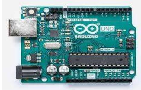
Fig -2: ardiono