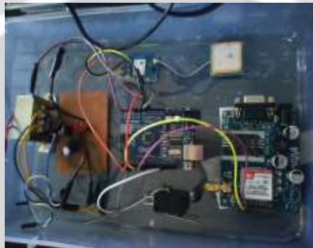
Fig -3: interfacing of all the devices

Whenever accident of vehicle is occurred then the device sends messages to given mobile number.