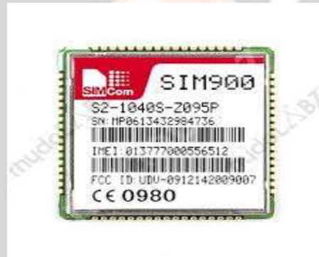
Fig -3: GSM module

For providing communication between the GPS, GSM and the allocated mobile number GSM SIM900 module is preferred. The name SIM900 says that, it is a tri band work ranging a frequency of 900MHz to 1900 MHz such as EGSM900 MHz, PCS 1900 MHz and DCS 1800 MHz. Receiving pin of GSM module and transmitting pin of GPS module are used for communication between the modules and the mobile phone.