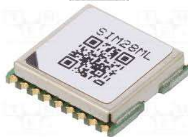
Fig -3: GPS module

To find the location on the earth the whole is divided into some coordinates where the location can be easily captured by a module called GPS module. Here the GPS used is SIM28ML. This GPS module will find the location of the vehicle and the information fetched by the GPS receiver is received through the coordinates and the received data is first send to arduino and the information is transmitted to the saved contact through GSM module. The frequency is operated in the range of 1575.42 MHz and the output of GPS module is in NMEA format which includes data like location in real time.