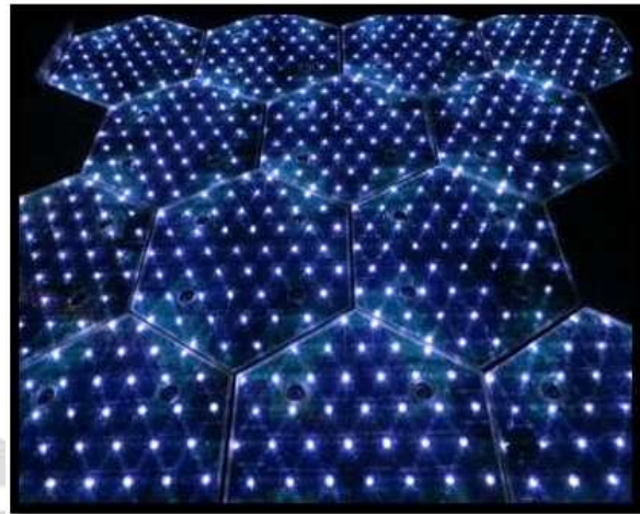
Figure 4: LED in Solar Roads