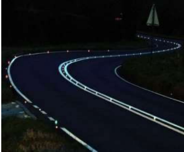
Figure3: Solar Roadways at Night Time on the Curved Road.