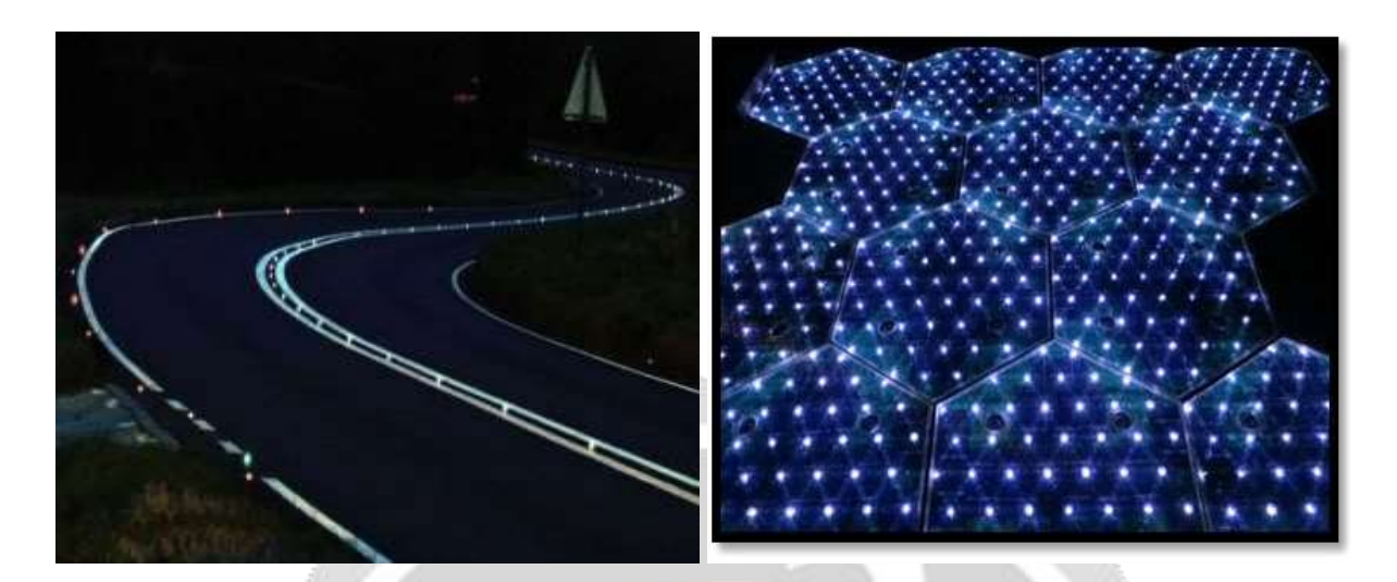
Figure3: Solar Roadways at Night Time on the Curved Road.