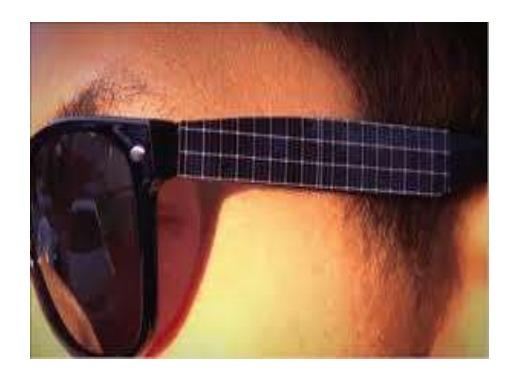
Fig- 4: Solar wearable.