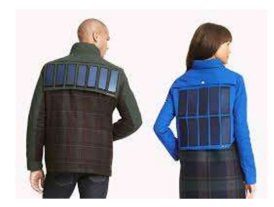
Fig- 5: Solar wearable.