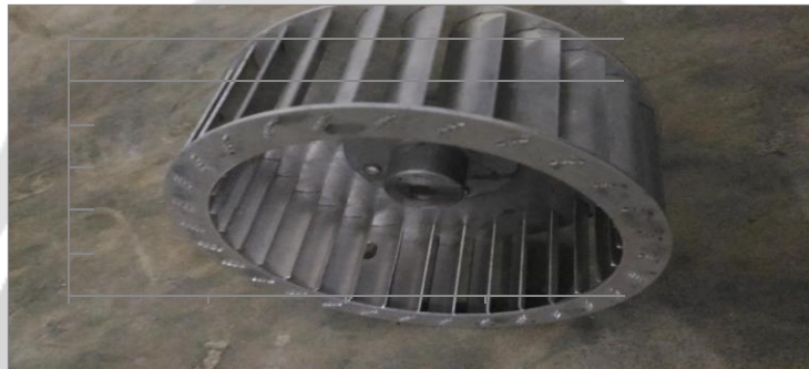
Chart -1: Design and Drawing

A water turbine is a rotary engine that takes energy from moving water. Water turbines were developed in the nineteenth century and were widely used for industrial power prior to electrical grids. Now they are mostly used for electric power generation. They harness a clean and renewable energy source.