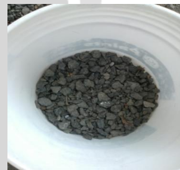
Figure 3: 25-40 mm size of gravel