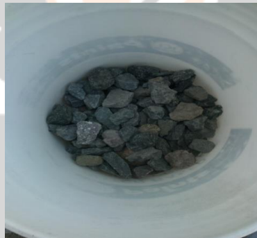
Figure 2: 40-50 mm size of gravel