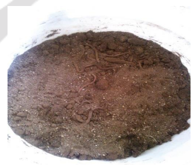
Figure 6: Soil Bed with Earthworms