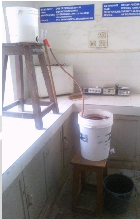
Figure 7: Experimental Set Up