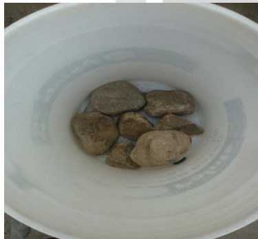
Figure 1: 50-60 mm size of gravel

Petrochemical wastewater was kept in 10lit of plastic drum. The drum was kept near reactor bed at elevated platform. The plastic drum had a tap at the bottom to which an irrigation system is attached. The irrigation system consisted of rubber pipe of 0.5" with holes of 3mm for trickling water that allowed uniform distribution of wastewater on reactor bed. The wastewater flowed through the pipe by gravity. The wastewater percolated down through the different layers of the reactor bed and at the end was collected in a plastic bucket kept at the bottom of the kit. This treated wastewater were collected and analyzed for COD.