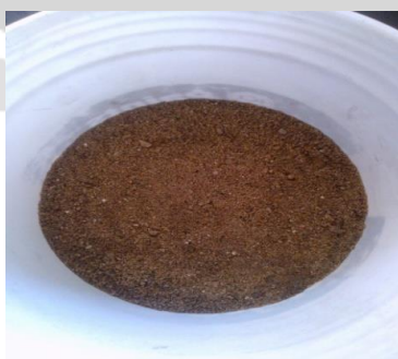
Figure 5: Sand