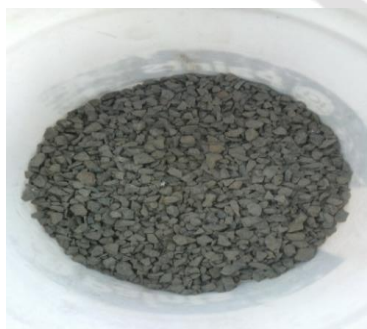
Figure 4: 10-12.5 mm size of gravel