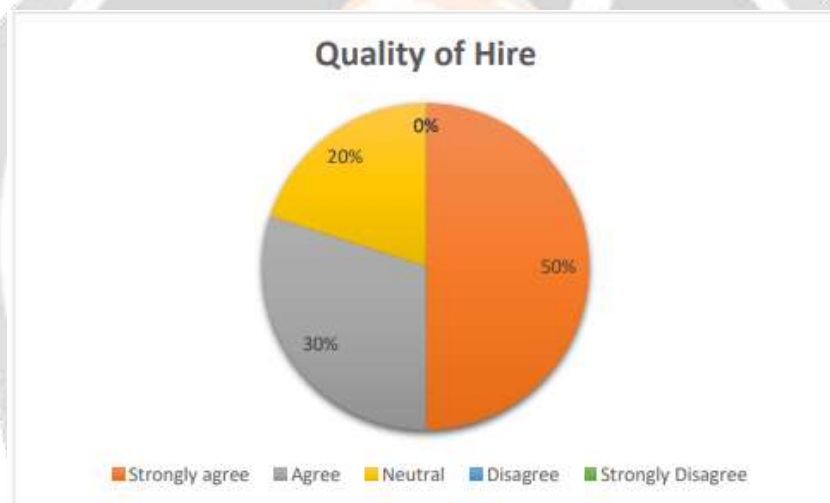
Figure 2: quality of hire from RPO

Someone's level of satisfaction with the selection process is not affected by their age.