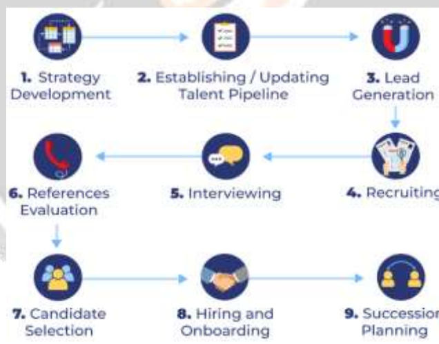
Figure 1. Talent Acquisition Steps