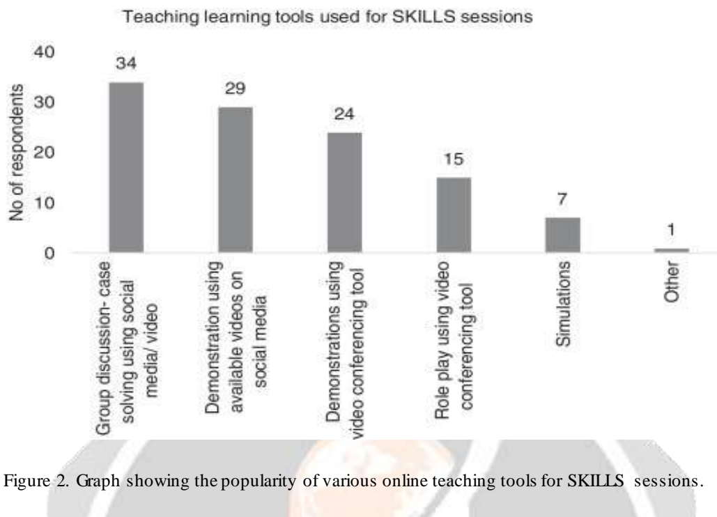
Figure 2. Graph showing the popularity of various online teaching tools for SKILLS sessions.

Following is the list of some of the digital initiatives of MHRD & UGC along with their access links for school students as well as Undergraduate level and Post graduate level education: