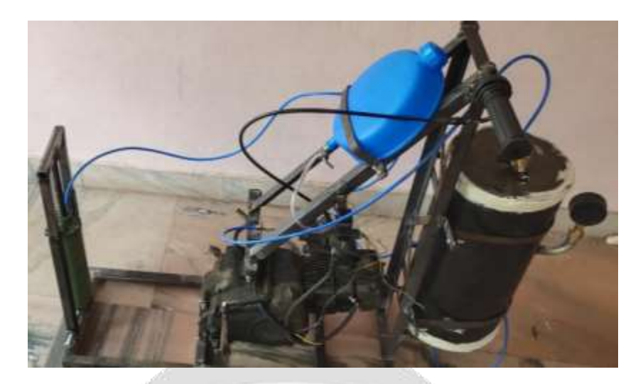
Fig-2: Fabricated setup