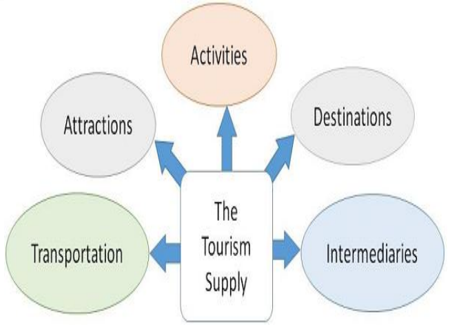
Fig -1: Architecture Diagram

Design science in tourism (DST) as a framework which can guide both the theoretical foundations and applications in tourism design. It is argued that since 1972 when Clare Gunn first published Vacationsape huge progress has been made which now provides the theory and tools needed to support DST.