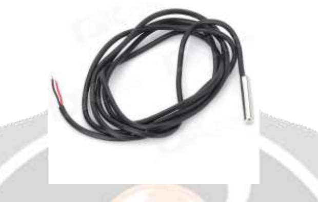
Figure: 5. Temperature sensor DS18B20

These 1-wire digital temperature sensors are fairly precise (\pm 0.5^{\circ}C \text{ over much of the range}) and can give up to 12 bits of precision from the onboard digital-to-analog converter. They work great with any microcontroller using a single digital pin, and you can even connect multiple ones to the same pin, each one has a unique 64-bit ID burned in at the factory to differentiate them.