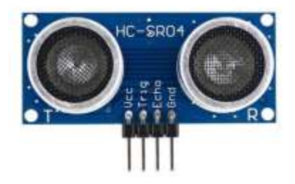
Figure: 7. Ultrasonic sensor HC-SR04