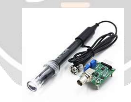
Figure:6. Liquid pH0-14

[3.5] pH SENSOR: pH sensor is an electronic device used to measure hydrogen-ion activity (acidity or alkalinity) in solution. Fundamentally, a pH meter consists of a voltmeter attached to a pH-responsive electrode and a reference (unvarying) electrode. The pH-responsive electrode is usually glass, and the reference is usually a mercury–mercurous chloride (calomel) electrode, although a silver–silver chloride electrode is sometimes used. When the two electrodes are immersed in a solution, they act as a battery. The glass electrode develops an electric potential (charge) that is directly related to the hydrogen-ion activity in the solution (59.2 millivolts per pH unit at 25 °C [77 °F]), and the voltmeter measures the potential difference between the glass and reference electrodes.