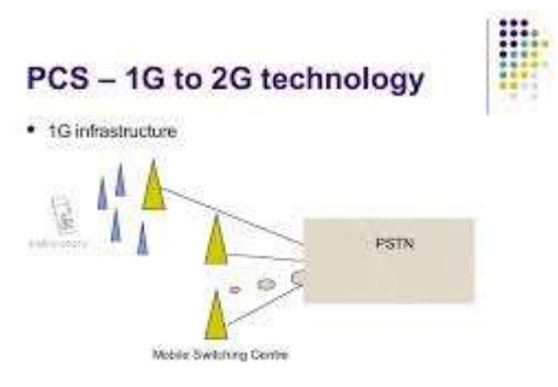
Fig-1: 1G Wireless Technology

Total Access Communication System and NMT-Nordic Mobile Telephone in Europe and J-TACS in Japan. These are constructed on simple FDMA-frequency division multiple access, that permitting consumers to sort the voice calls within a nation. As 1G used analog signals, the communication was less secure and no data roaming is provided. The signals were weak and hence easily prone to noise. Long distance transmission is not possible and speed are low. Reduced voice quality with deprived the phone battery life. Size of mobile phones are vast with frequent call drops and poor handoff reliability and speed up to 2.4Kbps. The frequency range is 150 MHz and above.