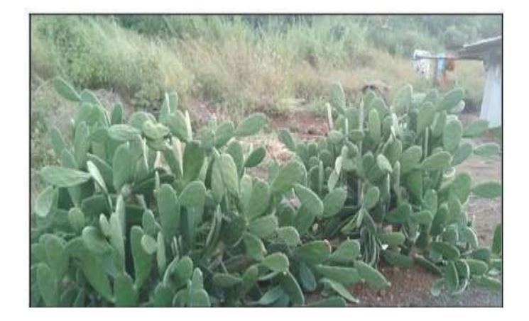
Figure 1: Cactus Opuntia Ficus Indica at Bamboo Garden, Amravati (MH)