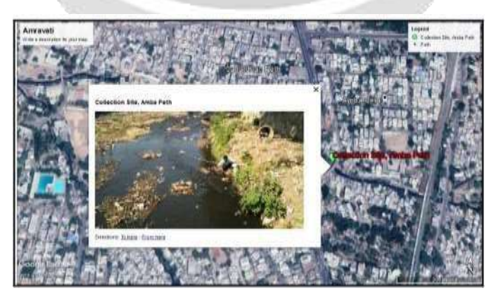
Figure 2: Wastewater Sample collection site

Sample was collected from Amba Nala near Amba Peth, Amravati (MH). It was observed that the sample was highly turbid and dark black in colour. Sample was collected and stored in clear plastic containers.