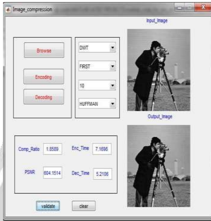
Figure 2: GUI two-dimensional DWT