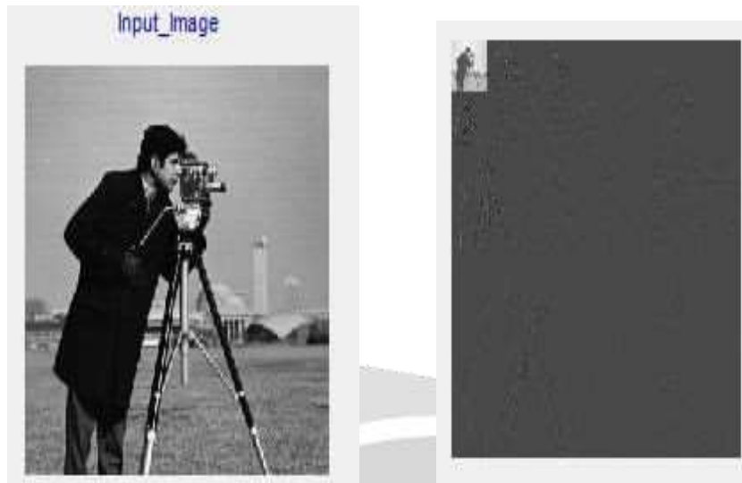
Figure 4: Data set 1 Input and Output Denoising image.