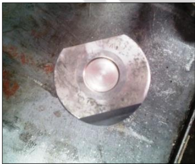
Figure 3:- adequate design of punch.