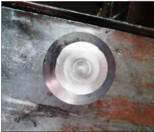
Figure 2:- inadequate design of the punch