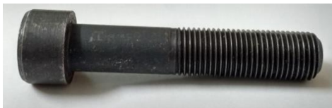
Figure 1:- Round headed centre bolt

Further the secondary processes have to be done for obtaining the final product. The round headed centre bolt is first sent for head shaving and chamfering process where the excessive material is removed to obtain required dimension of head and the angle of chamfer. Further grinding process is carried out before threading so that the major diameter after threading is within the dimensions specified. Next process is the threading process where the required type of threading is done on round headed centre bolt. Rolled type of threading mostly used for threading of centre bolts. Finally heat treatment is done (if required, according to the material used for