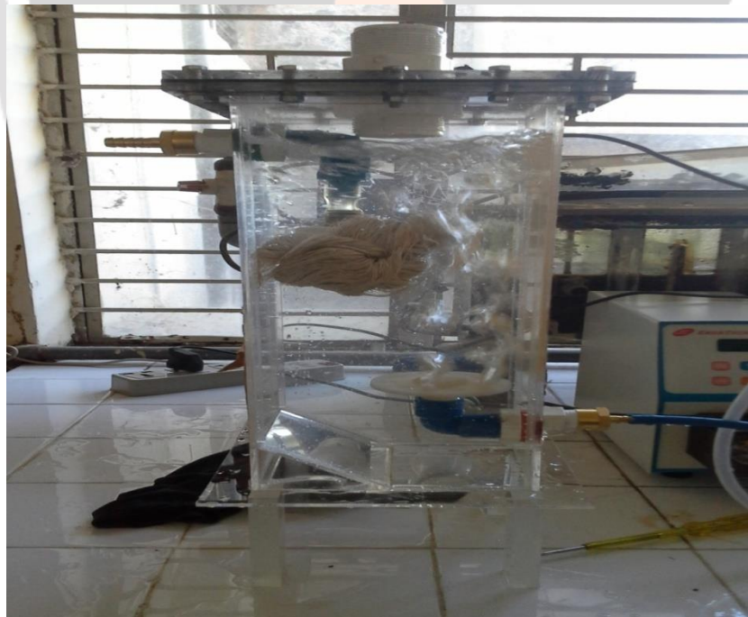
FIG. 1. MBR REACTOR