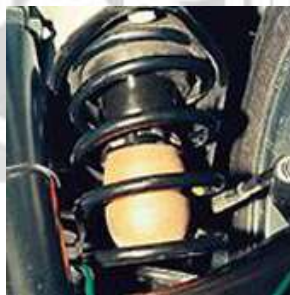
Fig -1 BASF supplies Elastocell components for the BMW S-Type strut assembly