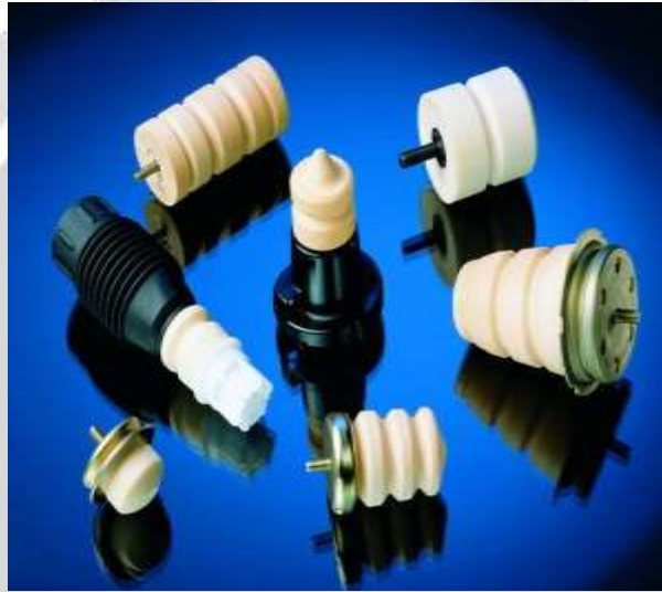
Fig -2 High-temperature MCU is already being used by Vibracoustics in jounce bumpers, shown here.

Vibracoustics' microcellular polyurethane (MCU) material isn't new, either, but its application in engine mounts is. The foam product is “extremely durable, highly effective in insulation, and very flexible in its design and application to the vehicle”