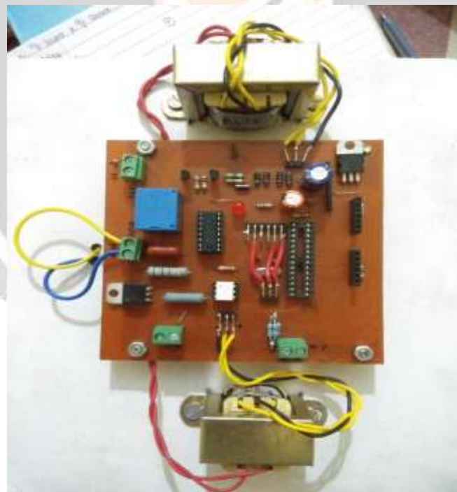
Fig 1: Voltage Stabilizer Model.

Figure 1 shows voltage stabilizer model. Voltage Stabilizer is a system designed to maintain a constant voltage level. Depending on the design it may be used to regulate one or more AC or DC voltages. Stabilizer stabilises the AC voltage. Sometimes a variation of voltage or spikes appears on an AC line. If we use this then the extra high voltage or low voltage can cause no problem to the appliances. It protects any devices connected to it from getting damaged.