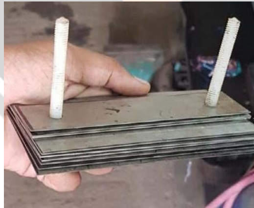
Figure 7. Holes being punched on metal sheets

The plates are drilled to push the screw through them. The plates are arranged to form the electrodes. They are arranged like plates-washers-plates-nuts. Nylon screws are used to hold the boards together. Metal nuts are used to evenly lay the tiles. Distilled water and catalytic sodium hydroxide are mixed. The whole generator is installed.