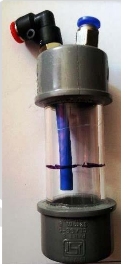
Figure 5. Bubbler

12 V 35 amps is used as a power source for the generator. The plus and minus poles of the battery are connected to the ends of the generators with connecting cables, so that when they come into contact, current is directed to the plates and electrolysis of water takes place. As a result, water molecules split into two hydrogen molecules and one oxygen molecule. The hydrogen production process can vary depending on the energy source used. More bubbles were observed when testing with a more powerful battery.