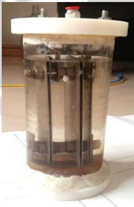
Figure 4. Finished generator product

The steel sheet was cut in basic engineering lab as per the following dimensions: Big plates: 152x75mm Small plates: 152x38mm Connecting plates: 152x25mm, 101x25mm, 82x25mm.