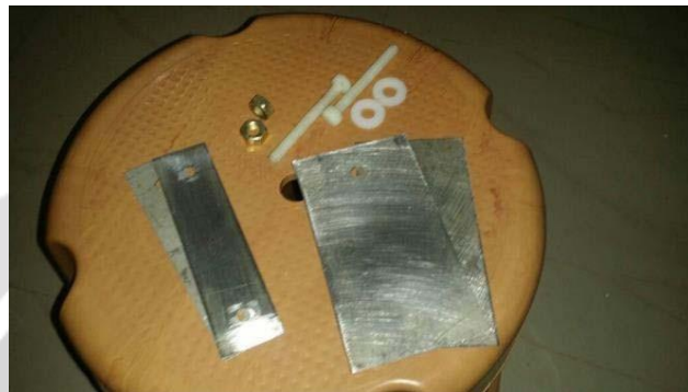
Figure 3. Steel plates, screws, washers and nuts

The steel sheet was cut in basic engineering lab as per the following dimensions: Big plates: 152x75mm Small plates: 152x38mm Connecting plates: 152x25mm, 101x25mm, 82x25mm.