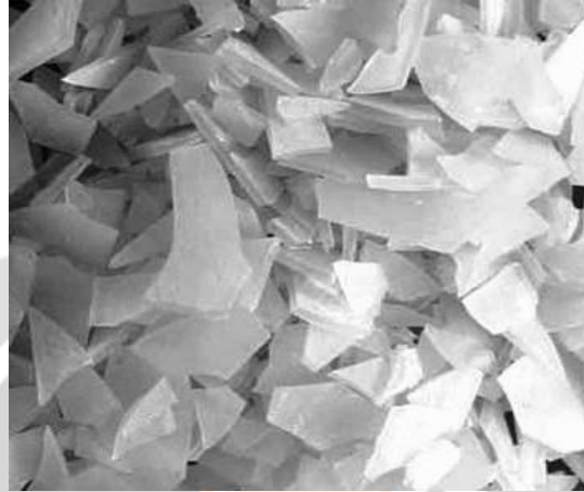
Figure 6. Sodium hydroxide flakes

Required nylon screw, washers and nuts bought. The acrylic tube was cut at 177.8mm long using a hacksaw blade sodium hydroxide flakes used as catalyst was acquired.