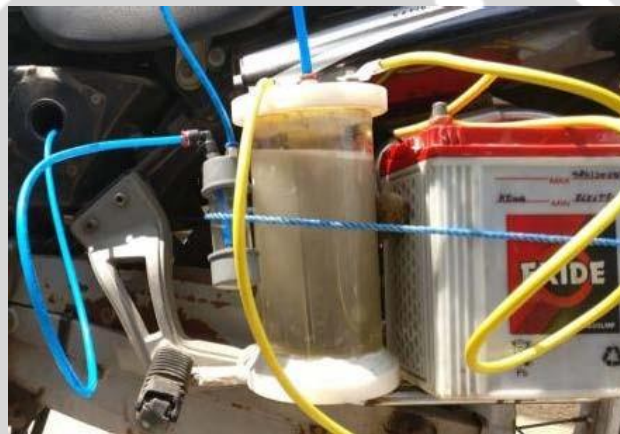
Figure 9. Equipment fixed on bike