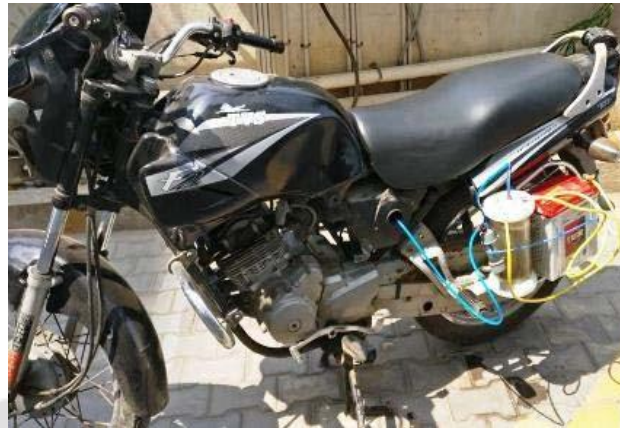
Figure 8. Equipment fixed on bike (Full view)